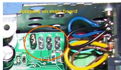
Jumpers on main board behind microphone socket

Radios are usually shipped in this mode. All functions and 24.5 to 29.9mhz continuous coverage. No jumpers.